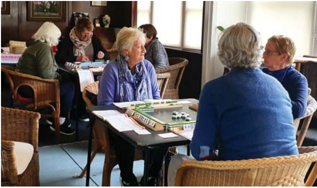
The Tuesday Mahjong group

For several months we had limited opportunities to play. Finally in Term 4 Mahjong tiles began clicking again. Many of us were beginners and found learning this new game had its challenges.