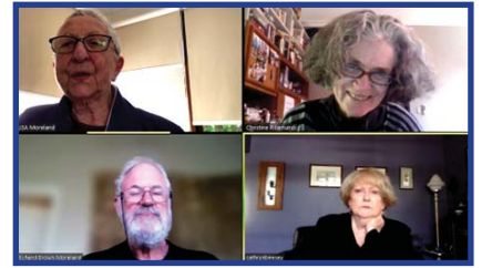
The Newsletter Team at work over Zoom